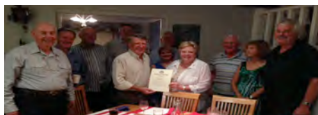
As it is members' right to have their say on Membership candidates, if you have any comments then please speak to me. A