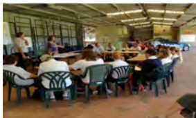
RYDA in session

Remember the big campaign to End Polio is so very close to achieving its goal. Two nations to go and the task will be complete!