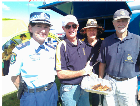
Look who was cooking for the most senior woman in the NSW Police force!

Women in Policing-100 Year Celebration Thank you to those who catered at this event.