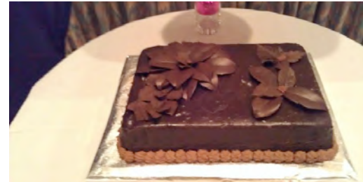
Thanks to Chris for such a wonderful contribution to our celebration-it was both beautiful and delicious