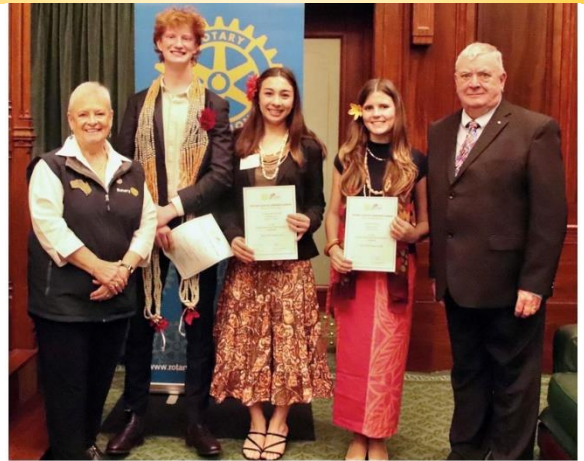
St Peter's Anglican College NSW

We are delighted to congratulate the St Peter's team representing the Solomon Islands at MUNA last weekend as they won the Totenhofer Peace Prize. This is presented each year to the delegation which makes the best contribution to world peace.