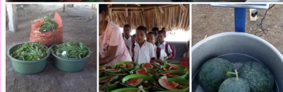
Watermelon and water spinach from Sulilaran School garden was enjoyed by students this week.